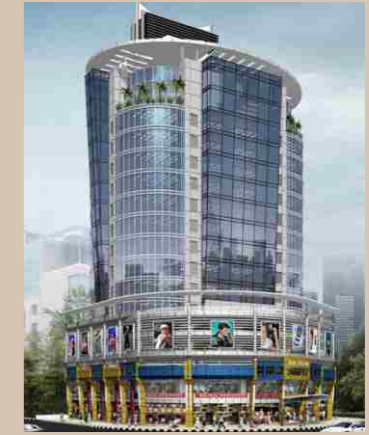
REALTECH PARK VASHI, NAVI MUMBAI