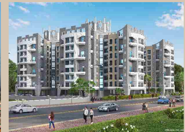
KONARK MEADOWS KALYAN