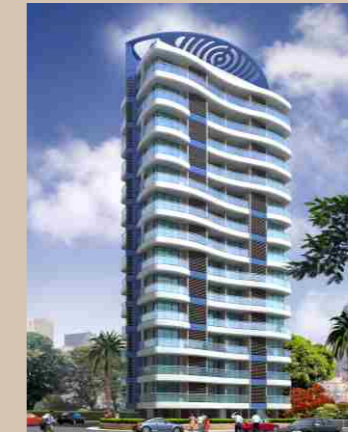
PRATHMESH VIEW NAHUR [W]