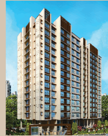
SILICON ENCLAVE TILAK NAGAR