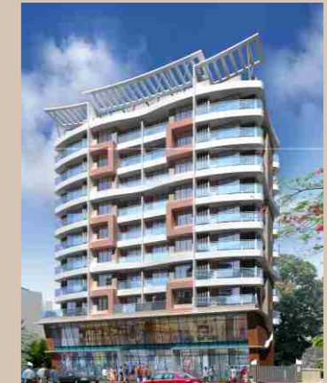
PRATHMESH VAIBHAV VIKHROLI [E]