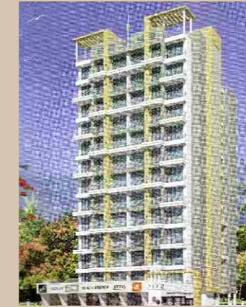
SILICON RESIDENCY ROADPALI, KHARGHAR